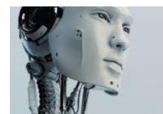
Robotics and the Workforce of the Future