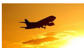
Careers in Aerospace and Aviation Virtual Event