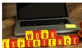
The Importance of Work Experience