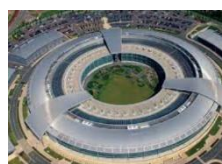
CyberFirst Degree Apprenticeship with GCHQ