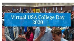
USA College Day moves online