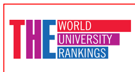
Times World Rankings released