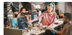
Growth of hybrid jobs